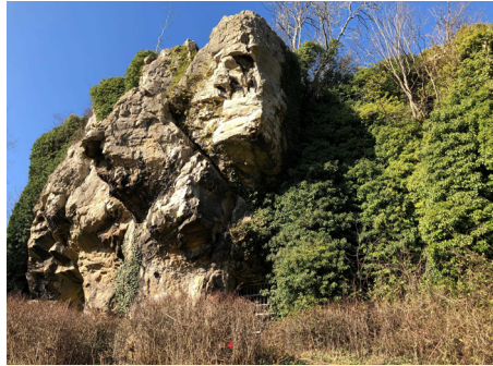
The breathtaking Creswell Crags