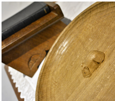
Find All Saints' famous mouse carvings

Listen to the story of how one young boy discovered the crypt where the Chalice and Bible were found, and view replicas of those historical findings. Search for the hidden Mayflower Mice, hear family stories of life in the hamlet of Babworth, explore the beautiful woodland setting and walk along the Pilgrim Way.