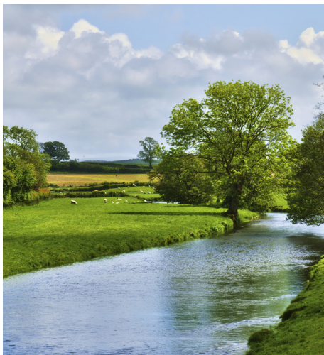
See the best of our wonderful county

Take a guided Mayflower Pilgrim Walk with successful Author and Photojournalist, Sally Outram. Follow in the footsteps of the Mayflower Pilgrims with a selection of circular walks which follow the Pilgrims Trail. The routes explore historic sites which are associated with the Pilgrims. Visit tranquil, quintessentially English villages, rivers and canals, see an abundance of wildlife, flora and fauna. (Additional cost applies). For more information and to book, please contact Sally Outram on 07986 011 903 or visit mayflowerpilgrimsnottinghamshire.com