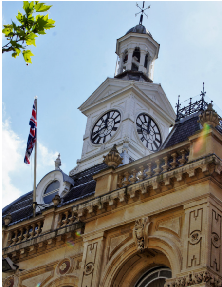
Retford Town Hall in the Market Square