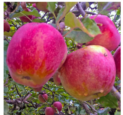
A great tribute to mark the occasion

A number of these exquisite trees are to be planted in various locations along key destinations of the Mayflower Pilgrim Trail and can be viewed on this tour.