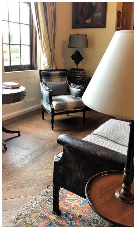
Enjoy a relaxing stay at Hodsock

Take a tour the house and hear a member of the family's historical stories about life in a stately home. Explore the stunning landscaped gardens with a guided photo tour. Enjoy delicious Afternoon Tea in one of the delightful rooms, or outdoors on the Italian Terrace overlooking the lake.