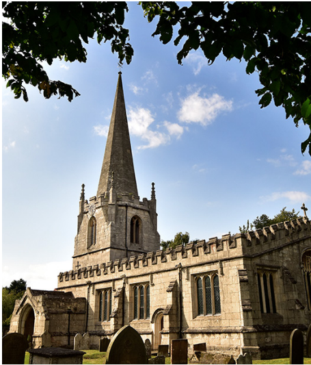
Parish church of St Wilfrid's, Scrooby