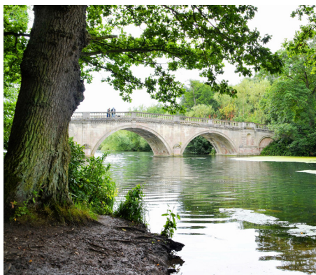
Clumber Park is well worth a visit

The Walled Kitchen Gardens are a pleasure; built in 1772 to supply the Dukes of Newcastle with vegetables and fruit, it is now home to the National Collection of apple varieties, including the new variety 'Pilgrim 400', and over 130 varieties of rhubarb! The 19th century glasshouses and palm house grow plants and produce all year around, offering glorious displays. Home grown produce is also used in the Garden Tea Room, where a variety of food and drinks are served. The beautiful lakeside provides stunning views and breath-taking walks. (Entry fees apply).