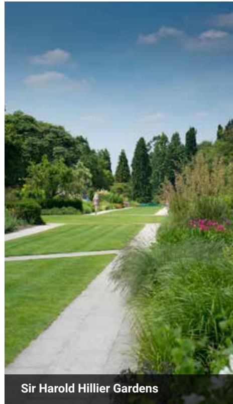
Sir Harold Hillier Gardens

Here you will discover amazing displays of different plants and habitats, including a Bog Garden, Winter Garden, Heather Garden, Hydrangea Walk, Himalayan Valley and Acer Valley. There are art exhibitions, concerts, guided walks and children's activities throughout the year and little ones will adore the exciting tree house.