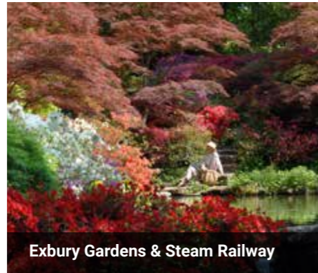
Exbury Gardens & Steam Railway

Here you can smell the heady aromas and see the stunning colours of these glorious flowers as they burst into bloom in spring. At other times of the year you can explore this garden's many attractions, including its miniature steam railway, tree-lined walks, adventure playground and spectacular views of the Beaulieu River.