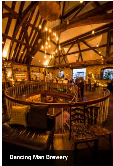
Dancing Man Brewery

Located in a 15th century building, once a wool store and a prison during the Napoleonic war, this micro-brewery also does wonderful innovative food for groups in a fantastic period setting.