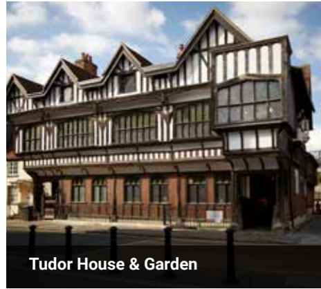
Tudor House & Garden

Southampton's most important historic building and revealing over 800 years of history in the heart of the old town. Located in the area of the city that the Pilgrims would have lived in whilst preparing the Mayflower and Speedwell for their voyage.