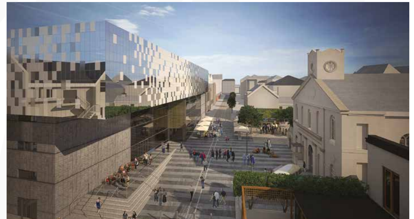
The Box, Plymouth, UK.