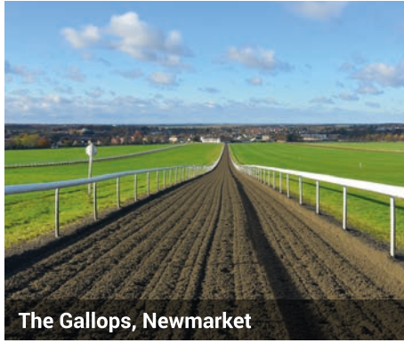
The Gallops, Newmarket