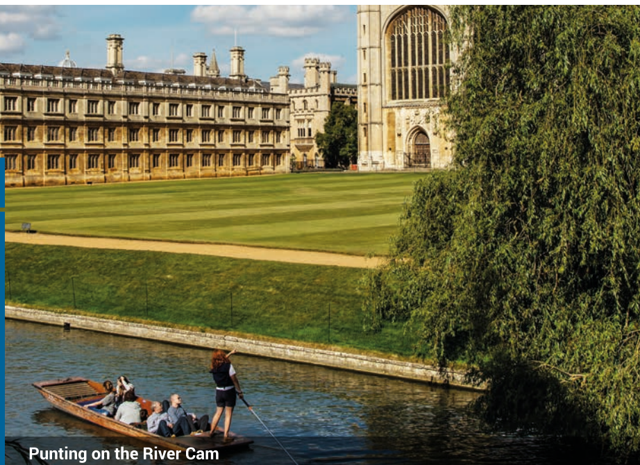
Punting on the River Cam