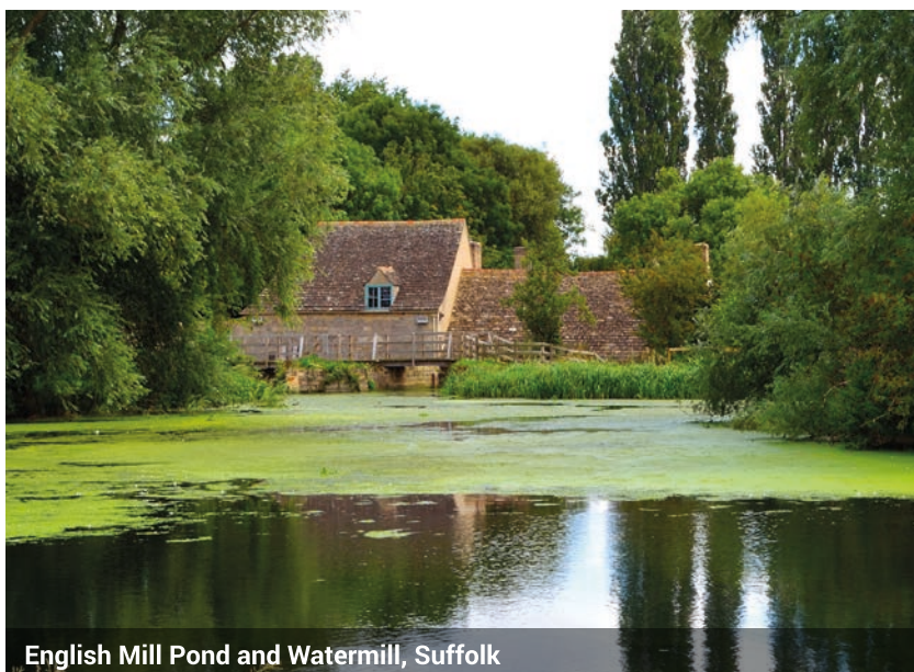
English Mill Pond and Watermill, Suffolk

Alternatively, why not just relax and enjoy a leisurely punt along the River Cam taking in the wonderful sights this beautiful and historic city has to offer.