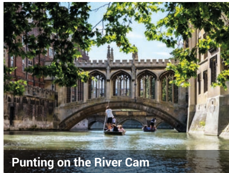
Punting on the River Cam

King's College Chapel, The Wren Library at Trinity College and the Bridge of Sighs, are just some of the famous Cambridge landmarks you can expect to see during this 45-minute chauffeured punt tour.