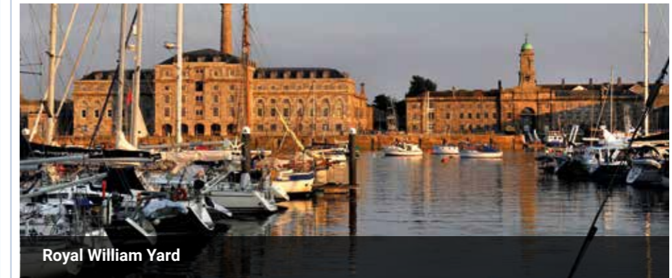
Royal William Yard

Take a tour of Grade I listed Royal William Yard, former Royal Naval victualling buildings which now boasts a plethora of cafés, bars and restaurants including Le Vignoble which offers wine tasting and over 250 different wines, champagnes and liqueurs from all over the world. You will also visit Ocean Studio’s artisan café, the Column Bakehouse.