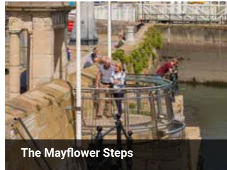
The Mayflower Steps

Plymouth Hoe (1 hour approx.) Follow in the footsteps of Sir Francis Drake and gaze out over the magnificent Plymouth Sound – one of the world’s finest natural harbours. For a 360 degree view climb the 93 steps of the iconic Smeaton’s Tower to see Plymouth’s stunning waterfront, city centre and countryside.