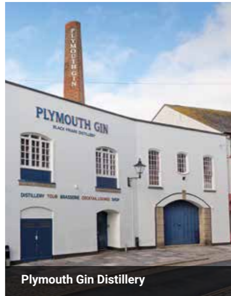
Plymouth Gin Distillery

Take a tour around Black Friars distillery, the home of Plymouth Gin and the UK’s oldest gin distillery, where it is believed that the Mayflower Pilgrims stayed before their voyage. Sample the award-winning Plymouth Gin in the distillery’s historic bar.