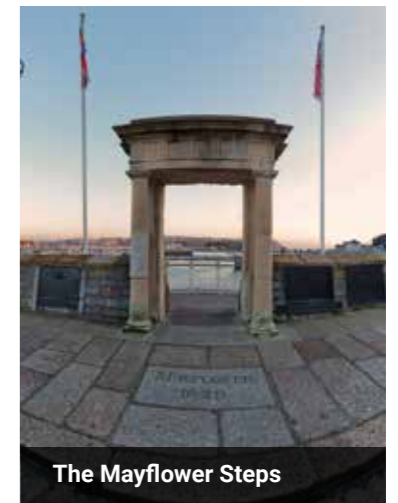
The Mayflower Steps

From the Port of Plymouth, visitors can explore the historic city with its spectacular sea views, which lies in the South West of England, UK, providing a gateway to the stunning coastlines of Devon and Cornwall and the natural beauty of Dartmoor National Park. It has the perfect blend of vibrant city culture, coast and countryside.