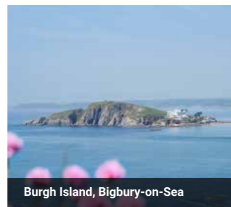
Burgh Island, Bigbury-on-Sea