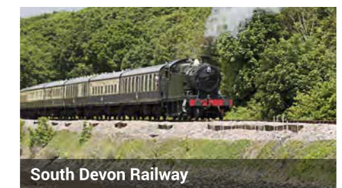
South Devon Railway

The multi-award winning South Devon Railway is one of Devon and the West Country's best loved tourist attractions and is the longest established steam railway in the south west.