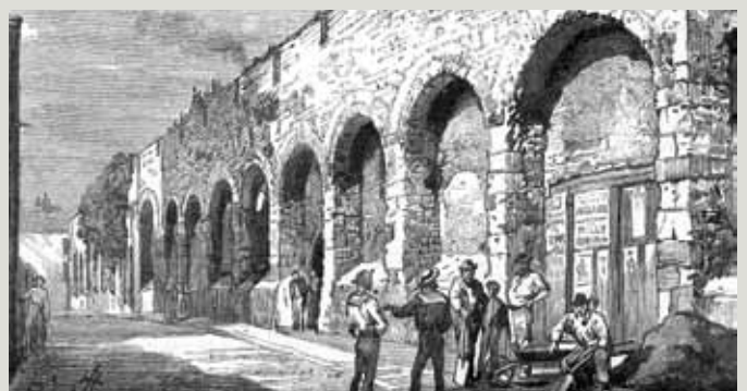
Old Town Walls, The Graphic 14th July 1883