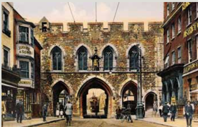
Bargate with trams 1920

The Bargate, built about 1180, and extended in 1320, kept out intruders and impressed visitors. A team of gunners defended the town and 3 guns were stationed at the Bargate.