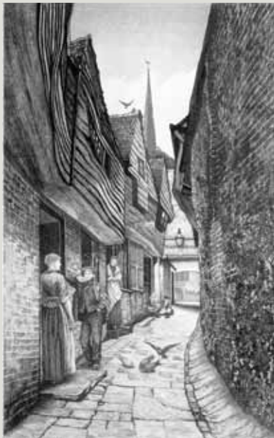
Blue Anchor Lane, Frank McFadden 1891

Blue Anchor Lane led from the medieval quayside into the town and the market in St Michael's Square. The stone arch forms part of the town walls. The portcullis slot is still visible.