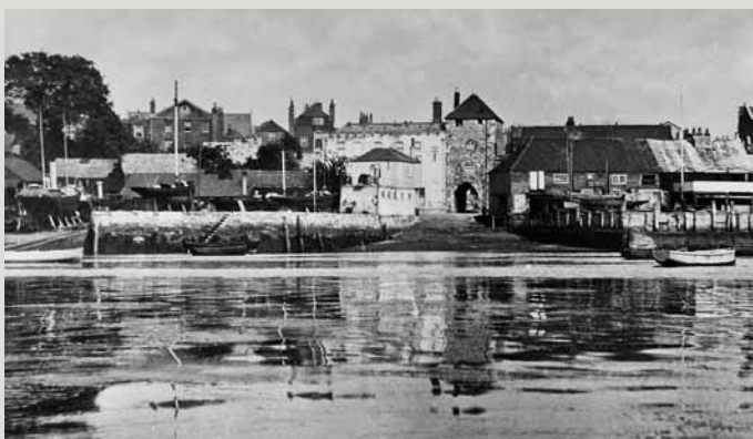
Westgate and West Quay 1910

The Westgate was built following the French Raid of 1338. In 1415 Henry V and his army departed through here on their way to victory at Agincourt. The sailors and passengers of the Mayflower and the Speedwell passed through Westgate on their way to America in 1620.