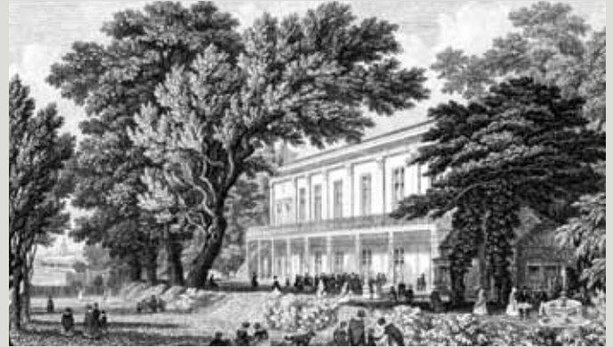
Royal Victoria Spa Assembly Rooms, Philip Brannon c.1840

In the eighteenth century Southampton became a fashionable spa and seaside resort visited by many wealthy and influential people, including royalty. Jane Austen stayed in Castle Square and attended balls at the Dolphin Hotel.