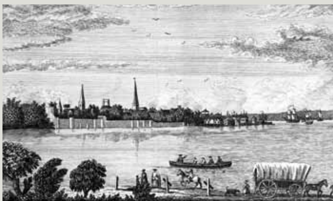
A view of Southampton c.1790

These huge stone walls were first built to defend the town from attack by land, and then extended to protect it from sea-borne enemies, following the devastating French raid of 1338.