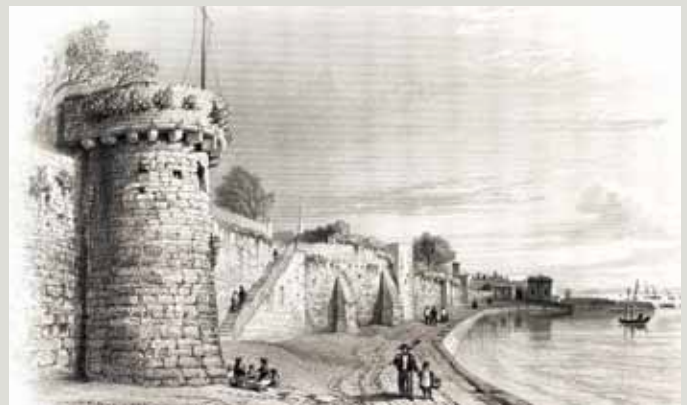
Walls of Southampton, Philip Brannon c.1847

150 years ago, visitors could descend these newly constructed steps to reach the beach below, after enjoying the panoramic view across the bay from the walls above.