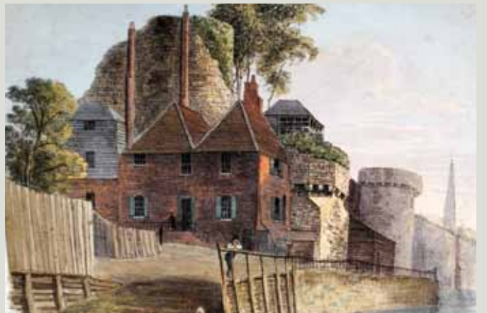
Arundel Tower and Orchard Street 1840

Arundel Tower may be named after Hironnelle, the magical horse of Sir Bevois, one of the mythical founders of Southampton. Legend has it that Hironnelle ('swallow' in French) was so named because he could out-fly swallows. When Sir Bevois died the horse flung himself from the tower in sorrow.