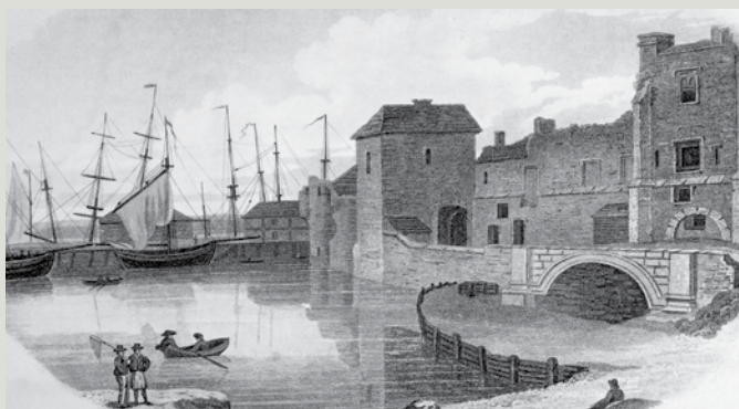
The culvert at God's House Tower 1817

Beyond the wall you can still see where the town ditch ran down to the shore near God's House Tower. A sluice gate there allowed the ditch to fill with water at high tide, to help defend the town.