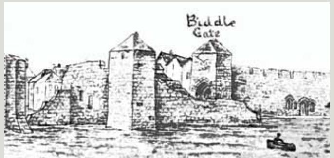
Artist's sketch late 1800s

In medieval times, this was a bustling waterfront lined with the houses of wealthy merchants. After the French Raid in 1338, the merchants were forced to move and the walls of their houses were blocked up to create the town walls. You can still see the outlines of the medieval doorways and windows.