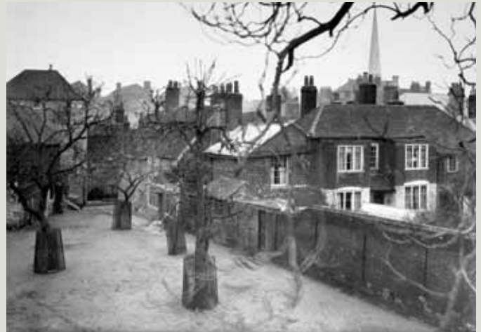
Cuckoo Lane Orchard 1920

Wealthy merchants lived in Cuckoo Lane during the 1200s. After the French raid of 1338 their waterfront properties were demolished to make way for the town wall. Over two hundred years later, William Shakespeare's patron, the Earl of Southampton, lived here.