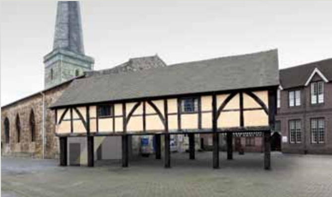
Digital impression of the Cloth Hall, which now stands at Westgate

Now dominated by the iconic Tudor House, this square was once the location of Westgate Hall. Wool was stored upstairs, and a fish market was held beneath. In 1634 the hall was dismantled and rebuilt next to Westgate. Paving slabs show where it once stood.