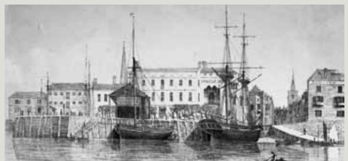
Customs House and Town Quay 1820

In 1476, Italian ships tied up at Town Quay to unload wines, dried fruits, spices and silks from the Mediterranean. The Watergate resonated with the voices of foreign sailors passing through the main entrance into the town.