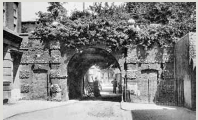
York Gate 1920

In 1202, King John gave £100 to "close the town" and build a line of defences to protect its people. The North Wall was the first to be built and links Bargate to Eastgate and Polymond Tower. York Gate was cut into the wall in 1769.