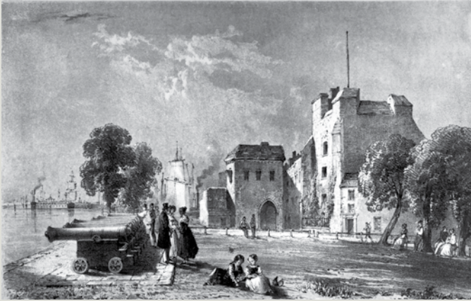
God's House Tower 1850

God's House Tower provided formidable defence for the medieval town. The town gunner lived here and the town's armoury of guns, powder and shot was stored at ground level. The guns were hauled up through the tower when needed. Keyhole shaped gun ports are visible around the building.