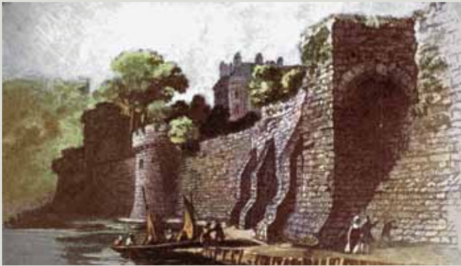
Catchcold Tower 1820

If you were a raider with plans to attack the medieval town, the soldiers posted at Catchcold Tower and armed with guns would “catch you cold”.