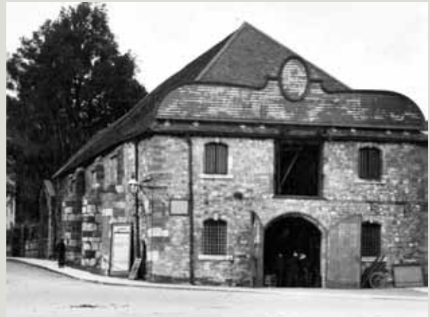
The Wool House early 1900s

During the 1400s, wool was the single largest export from the town. The Wool House was built to store wool right on the quayside. The town mayor, Thomas Middleton, built a large crane next to it for moving heavy cargo.