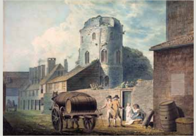
Polymond Tower, Edward Dayes 1794

Walk along Back of The Walls toward East Street and the Bargate, looking out for remains of the town walls and Polymond Tower. Or turn left toward the High Street and visit the church of Holyrood, now a memorial to merchant seamen.