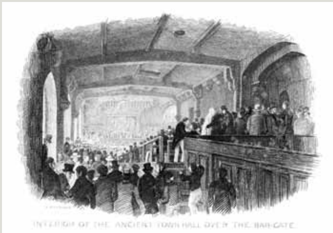
Bargate interior c.1847

Entering the medieval walled town through the Bargate's grand entrance, you follow in the footsteps of generations of townspeople and visitors, who came to Southampton to trade or sail from its port.