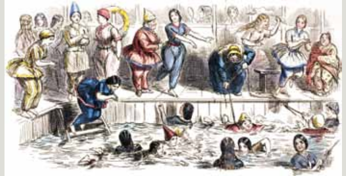
Ladies bathing c.1800

In the mid 1700s, doctors prescribed salt water bathing as a cure for many illnesses, and Southampton became a fashionable place to visit. This area was home to Mr Martin's Baths and the Assembly Rooms.