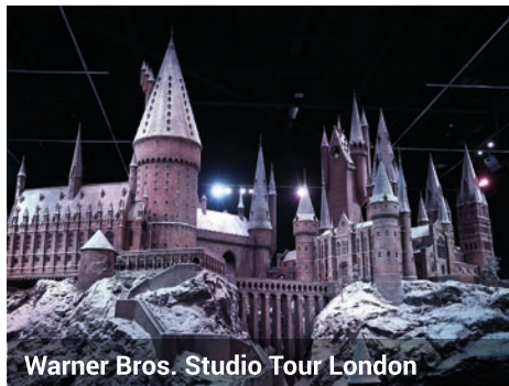
Warner Bros. Studio Tour London

Wands at the ready! Journey behind the scenes of the Harry Potter film series and experience the magic that has gone into creating the most successful film series of all time. Visitors are invited to step on to authentic sets, costumes, props and spellbinding special effects, including the original Great Hall, miniature scale model of Hogwarts castle, Diagon Alley, Gryffindor common room and the iconic Platform 9 ¾ that houses the original Hogwarts Express locomotive. Located at the Studios where all 8 films were produced, the Studio Tour showcases the incredible British talent, imagination and artistry that went into making the impossible a reality on screen.