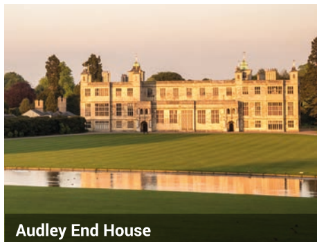
Audley End House

Explore this decadent Jacobean mansion house and meet the staff in the Victorian Service Wing. Enjoy stunning views across the unspoilt Essex countryside and wander the tranquil gardens created by 'Capability' Brown, gold winner of Anglia in Bloom Awards 2017. Then gallop across to see the horses in the Victorian stable yard, and run, jump and climb in the children's play area.