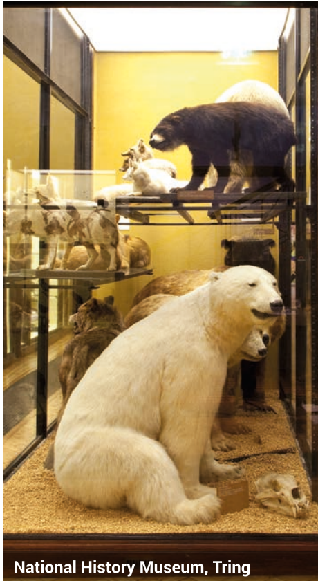
National History Museum, Tring