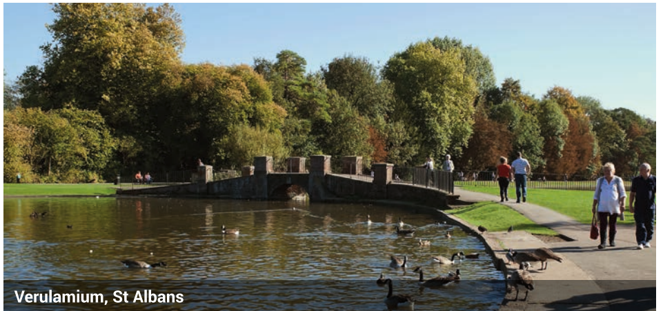
Verulamium, St Albans

Steering our future, inspired by the past.