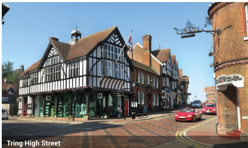
Tring High Street

Ultimate Minibuses www.ultimateminibuses.co.uk +44 (0)1708 300100 or +44 (0)2070 607207 One of Essex and London's finest minibus hire and coach hire companies operating to bring luxury executive travel and individual transport to all of their clients.. Capacity: 8-49